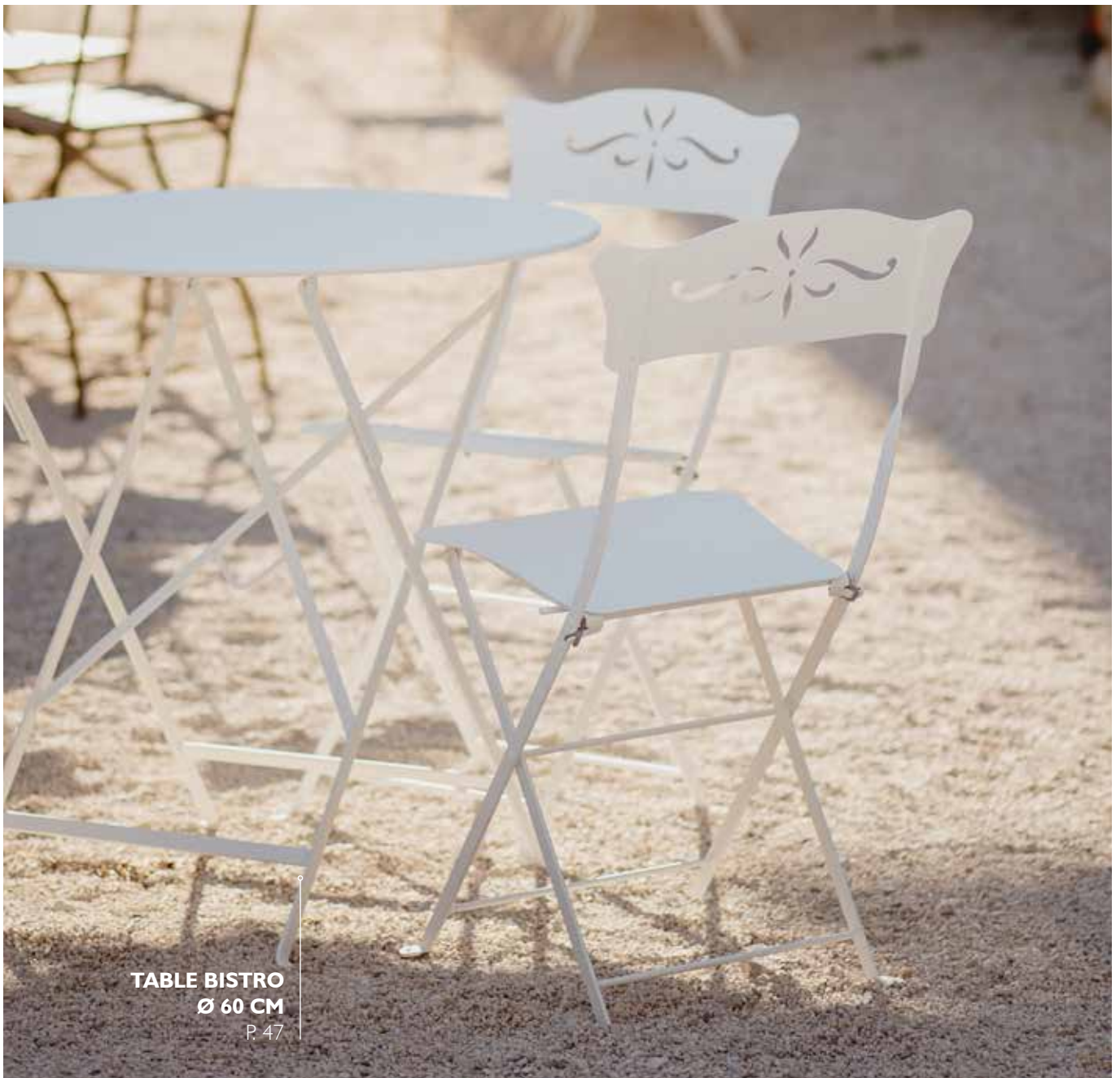
TABLE BISTRO Ø 60 CM P. 47

* Very High Protection treatment recommended for Contract use